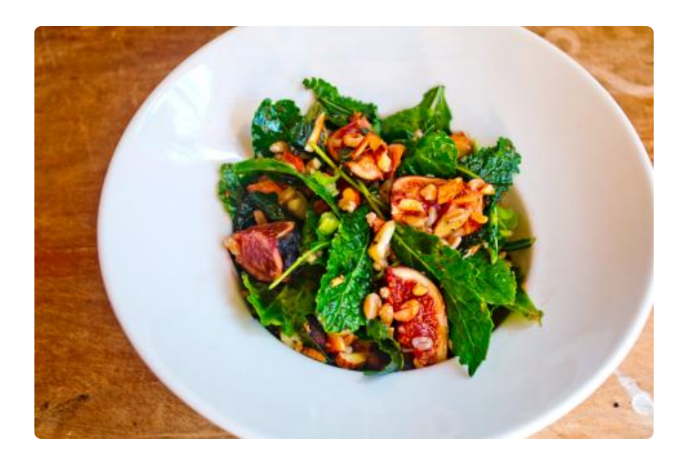
FIG & FARRO SALAD

PACIFIC COAST FARMERS' MARKET ASSOCIATION